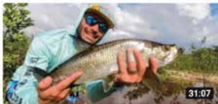
So Many Fish!! DIY Fly Fishing Ambergris Caye, Belize