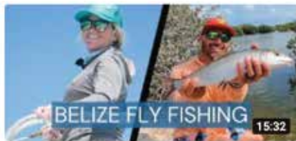
The Iguana House! Fly Fishing Ambergris Caye, Belize